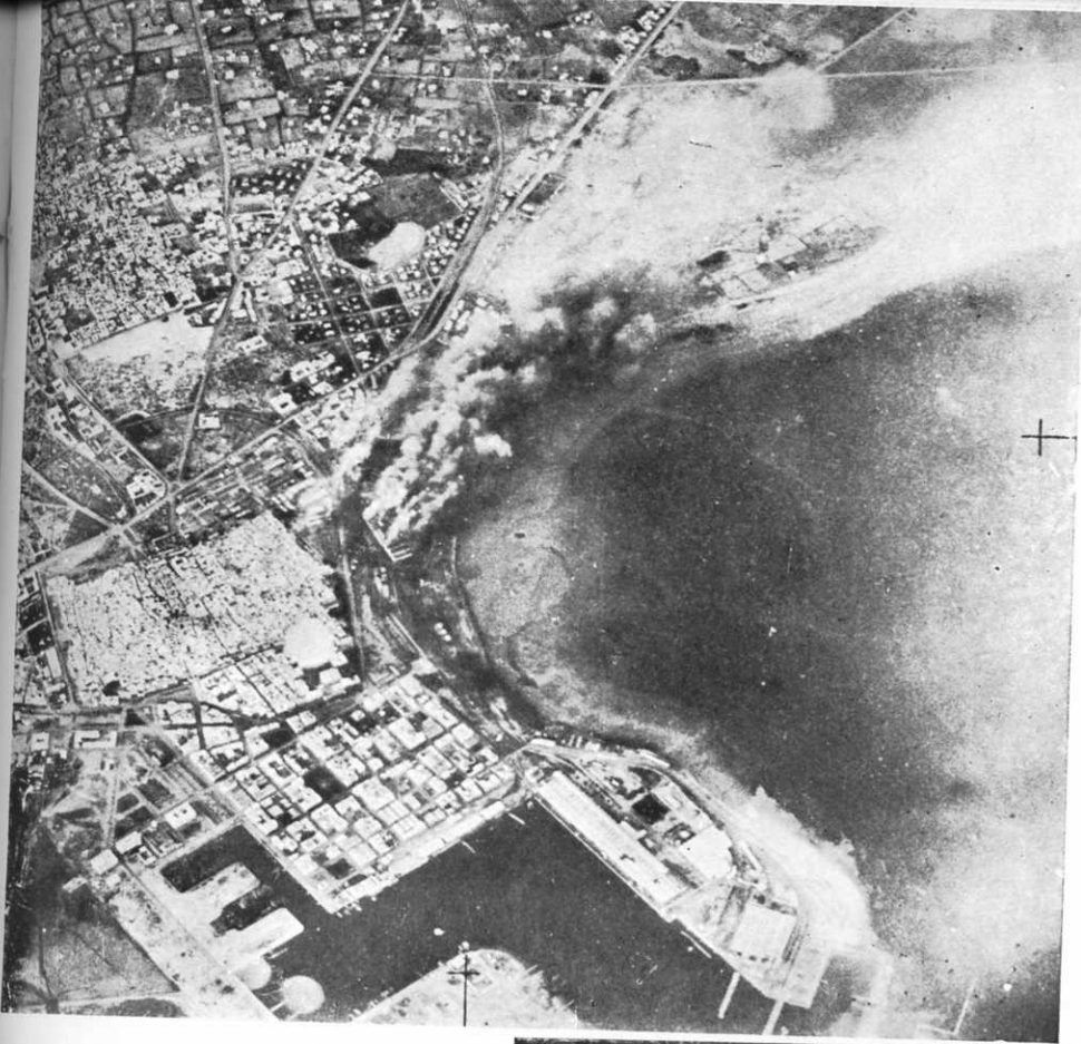
Sfax, one of Tunisia's most heavily bombed cities.